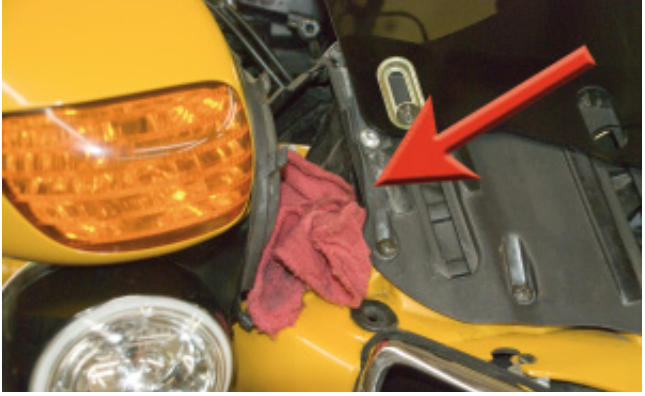
The VERY important rag location. Garnish and Clamp are removed in this photo.