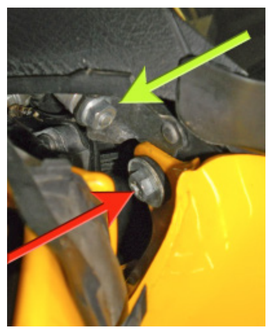
Windshield Garnish Bolt, Washer, Grommet (Red) and Windshield Clamp Nut (Green).

them toward each other and retighten. If further tightening is needed, follow the same procedure moving the top of the rails toward each other.